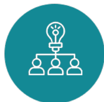
Team & Management Plan