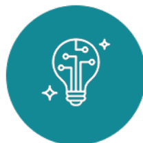
Digital Technology Innovation