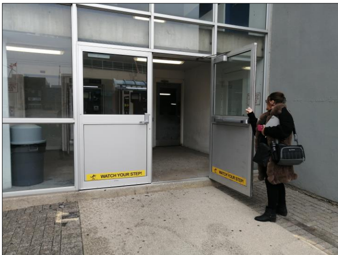
Dougall Avenue Entrance

Dougall Ave. entrance is not accessible. There is a double set of doors with no actuator and a steep step to access the vestibule on the first floor where the payment kiosk is located.