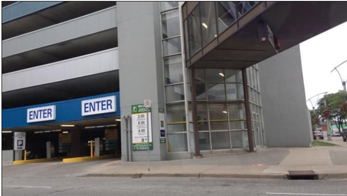
Parking Garage on Pitt Street - Downtown Windsor

Faculty and staff permits provide access to the parking garage directly East of the Pitt/Ferry building at the same rate as the parking structure on the main campus. Students may purchase a permit to park in 1 Riverside Drive Parking Garage located next to the Keg Downtown Windsor. Holders of downtown permits will also be able to use the parking lot at Askin and University Avenues while visiting main campus.