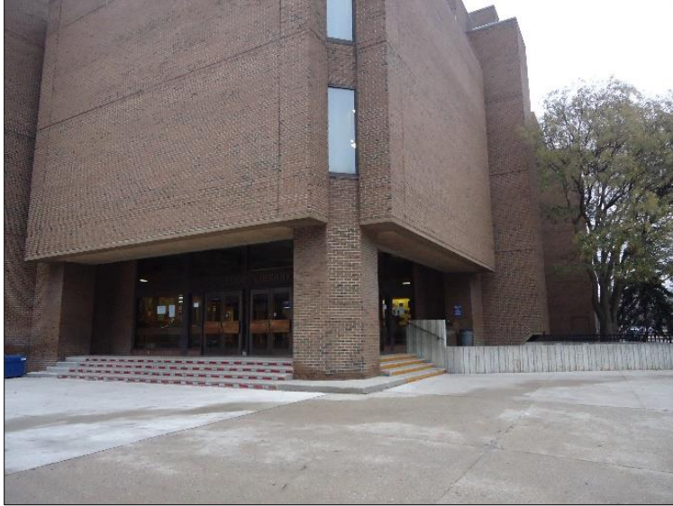
The exterior of the southwest corner of Leddy Library.