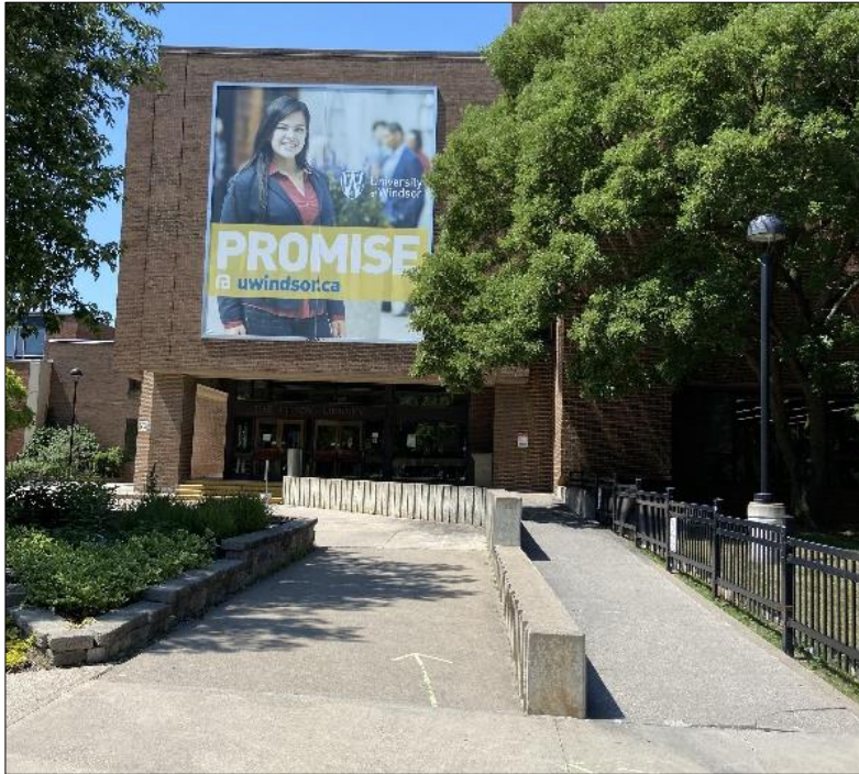
Outdoor view of the main entrance to Leddy Library. Ramp leading up to doors with actuators.

The only entrance to the Leddy Library is accessible and is located at the southwest corner of the building. There is an exterior pathway that leads to the entrance with actuators on the exterior and interior doors. There is a ramp inside the lobby which leads to an accessible door that is located between turnstiles. The push button for this door is located on the pillar nearest the door.