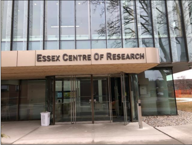
Main Entrance of the Essex Centre of Research building. Ground level with actuators.

The main entrance is located on the north side of the building, directly across from the University Computer Centre. It is accessible as it is ground level and is equipped actuators. The elevator in CORE provides access to all four levels in Essex Hall and in the CORE building.