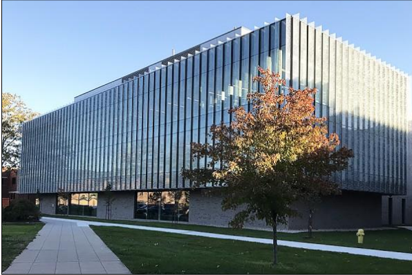
Exterior view of Essex Centre of Research (CORe) building.