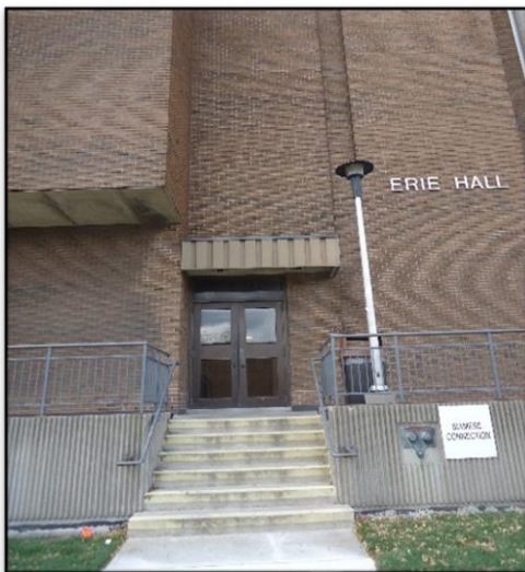
East entrance with stair access facing Turtle Island Walkway.

Additional entrances to Erie Hall with stair access are located on the west side (near Turtle Island Walkway) and the south side of the building.