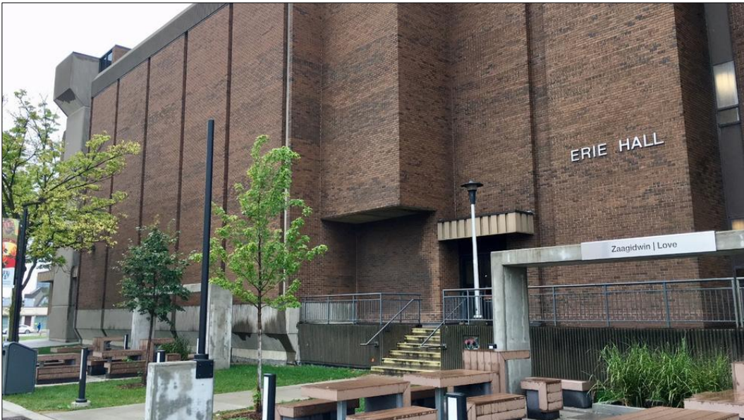
Outside view of Erie Hall, east side entrance.