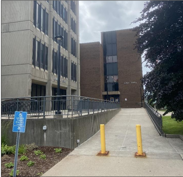
An accessible walkway (ramp) leads to the accessible entrance of Erie Hall (brown building above) and an accessible entrance to Lambton Tower (grey building above).

Note: There is no elevator in Erie Hall but Lambton Tower has an elevator. Both buildings are connected on floors 1-3. See notes under the “Elevator” heading below.