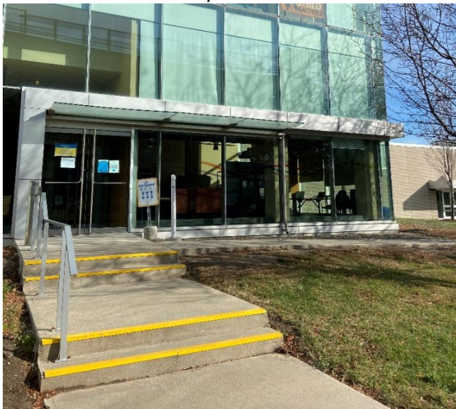
Entrance on west side of building