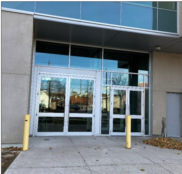
Entrance on east side of building, close to northeast corner