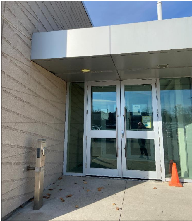
Entrance on south side of the building