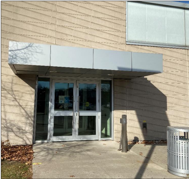
Entrance on south side of the building, close to southwest corner