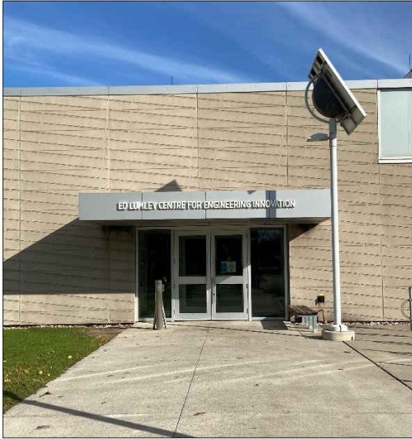
Entrance on west side of building, leading to Small Business Centre