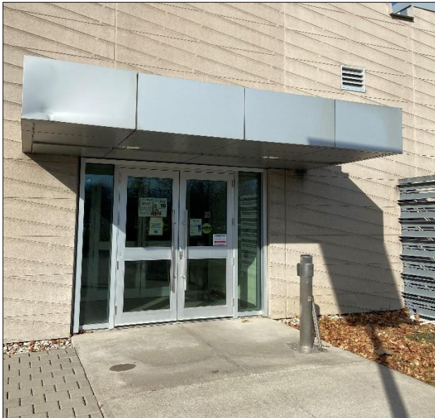
Entrance on south side of building, close to the southeast corner