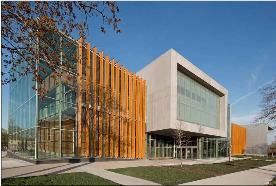
Exterior view of Ed Lumley Centre for Engineering Innovation