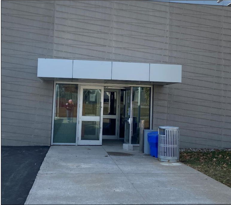
Entrance on east side of building, close to southeast corner