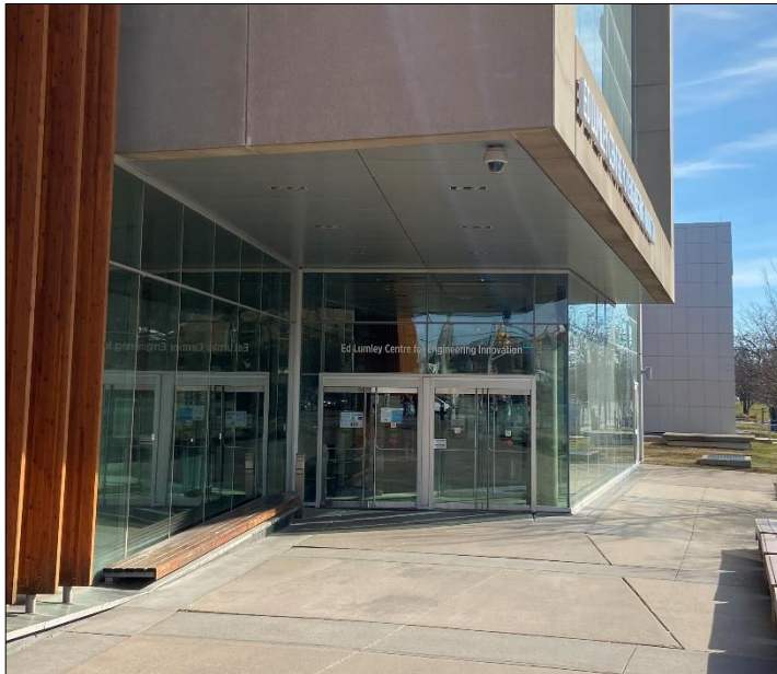
Main entrance located at northwest corner of the building

The main entrance is accessible and is located at the northwest corner of the building, facing Wyandotte Street West.