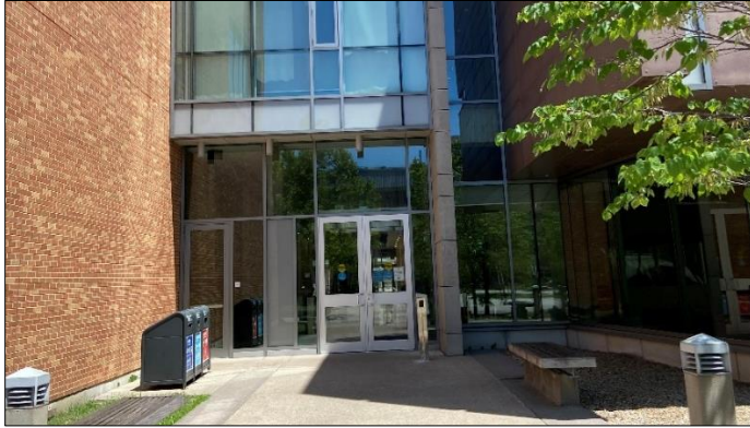
Outside view of the main entrance to the Medical Education Centre on the west side.

The main entrance is equipped with actuators and is located at ground level on the west side, facing Turtle Island Walkway. Persons with vision impairment should note that the doors are clear glass.