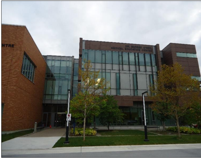
Dr. Murray O'Neil Medical Education Centre. View of west side of the building, including the entrance.

Google Maps to Dr. Murray O'Neil Medical Education Centre