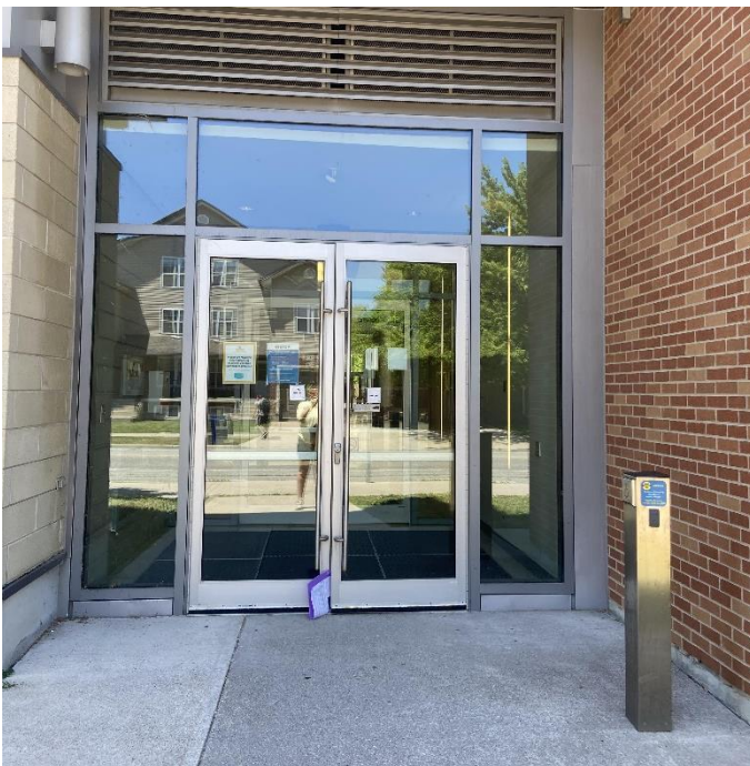
Outside view of the additional entrance to the Medical Education Centre. Ground level with actuators and glass doors.

An additional accessible entrance is on the east side of the building facing California Avenue. Actuators are located on the left side of the doors. Persons with vision impairment should note that the doors are clear glass.