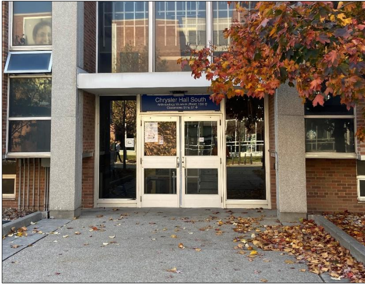
Exterior of entrance with stair access located on east side of Chrysler Hall South.