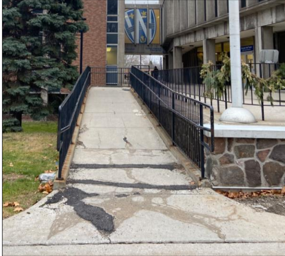
West entrance to CHT with access to CHS