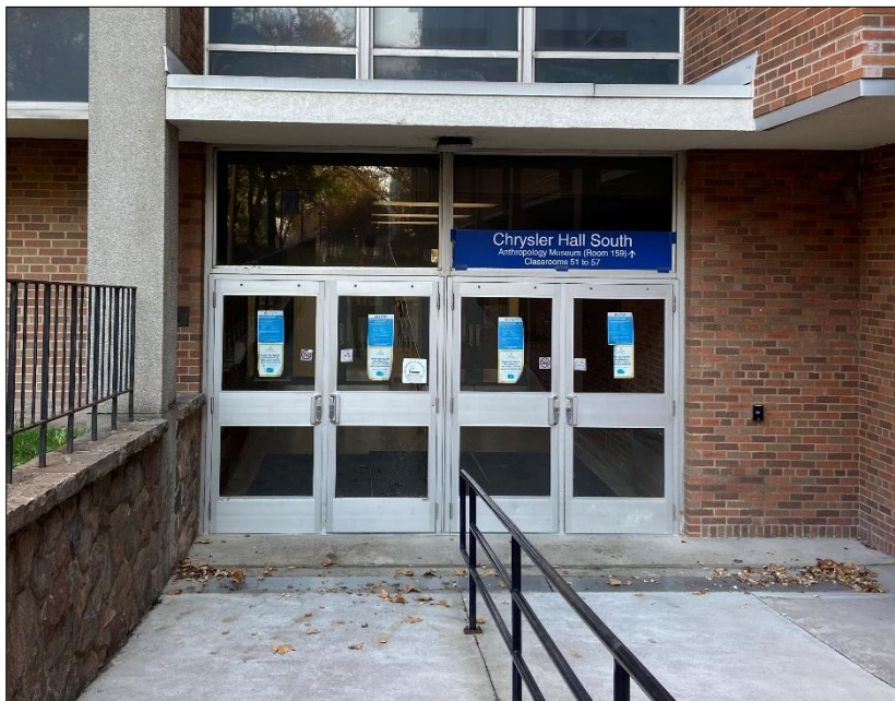
Exterior to inaccessible entrance on west side of Chrysler Hall South.