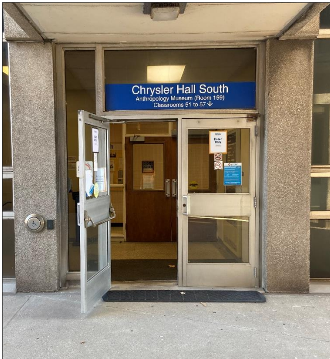
Exterior to main entrance to Chrysler Hall South. Accessible and equipped with actuators.

Note: the entire lower level and the second level of Chrysler Hall North (CHN), Chrysler Hall Tower (CHT), and Chrysler Hall South (CHS) are connected. This provides several access points to CHS.