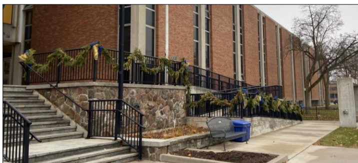
East entrance to CHT with access to CHS.