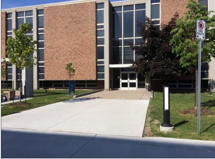
Exterior of Chrysler Hall South