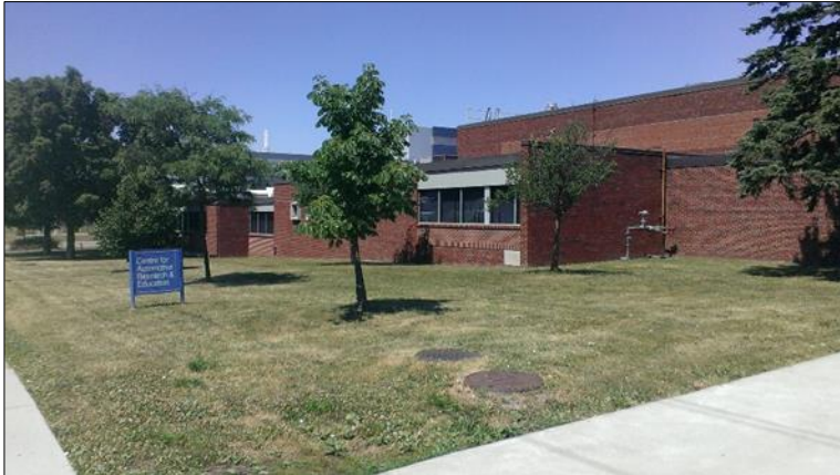
CARE Building facing California Ave.