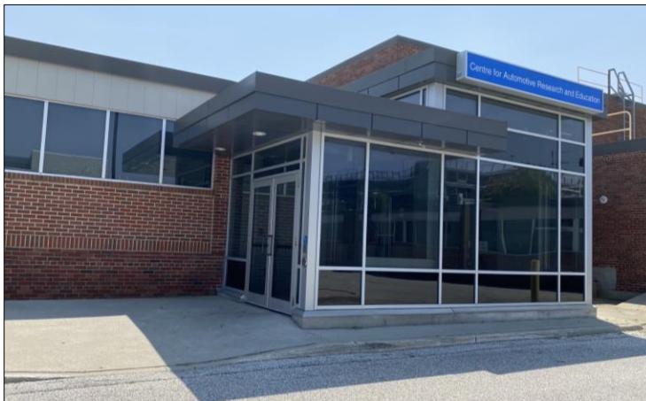
1 CARE north entrance.

The north entrance faces the Engineering Parking Lot. Once inside this entrance, there is a set of stairs and lift to access main level.