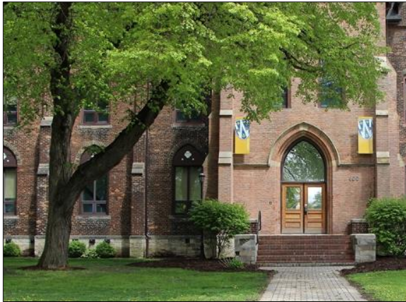
Assumption Hall facing Huron Church Road.