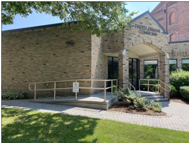
3 Freed Orman Commons' main entrance is equipped with a ramp and automatic door openers.

Freed Orman Commons is connected to Assumption Hall to the northeast. The main entrance is accessible with a ramp and automatic door openers. The hall is all on one level. There is a multi-user, accessible men's and women's washrooms located to the left of the main entrance.