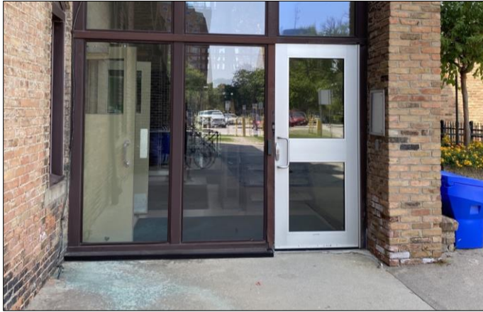
2 East entrance to Assumption Hall. Ground level but no actuators.

There is an entrance on the east side of the parking lot. This is ground level but not equipped with actuators.