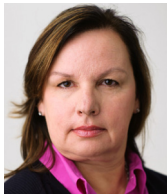
Ruth Kuras Faculty of Law

The Faculty Award is presented to professors who best exemplify the attributes of an exceptional teacher for the school year in question. The Honourable Justice Robert Abbey Award for Outstanding Special Lecturer is presented to the sessional instructor who best exemplifies the attributes of an exceptional teacher for the school year in question.