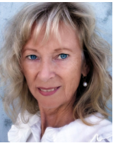
Sigi Torinus School of Creative Arts

"Vicky is constantly considering promising practices in teaching and how to convey information and encourage critical thinking through all aspects of her courses, including lectures, discussions, readings, assignments, and exams." ~ Nomination File