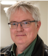
Robert Weir Department of Languages, Literatures and Cultures